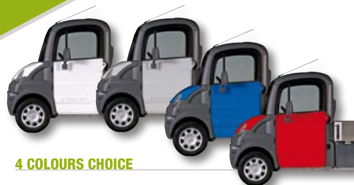
4 COLOURS CHOICE