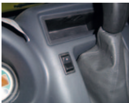
Presence bell (all electric versions)