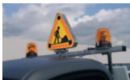
Roadsign bar (with 2 beacon lights)