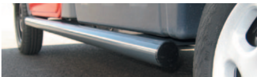
Side impact bars

AIXAM-MÉGA - 56 route de Pugny BP 112 - 73101 AIX-LES-BAINS CEDEX - FRANCE