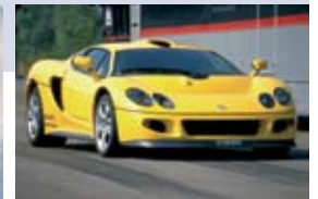
MEGA Monte Carlo

- Winner of the Andros Trophy in 1994 and many other victories.