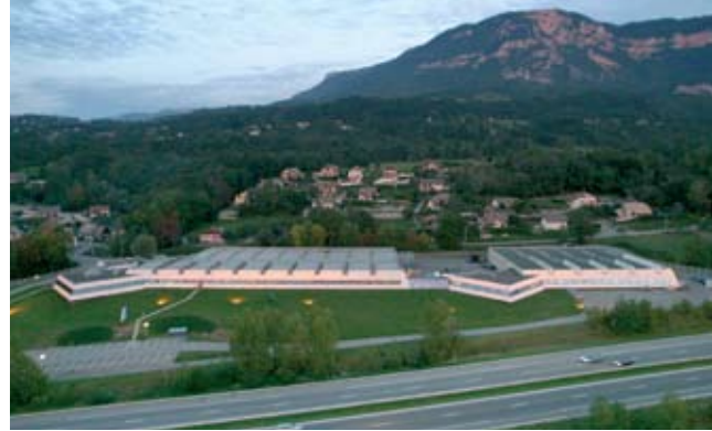
*Homologation under European Directive 2002/24/CE

The manufacture of the main components, the final assembly and the quality controls on our vehicles* are all performed by qualified personnel. Over an area of nearly 8 hectares, we produce more than 14 000 vehicles annually for the French, European and North American markets.